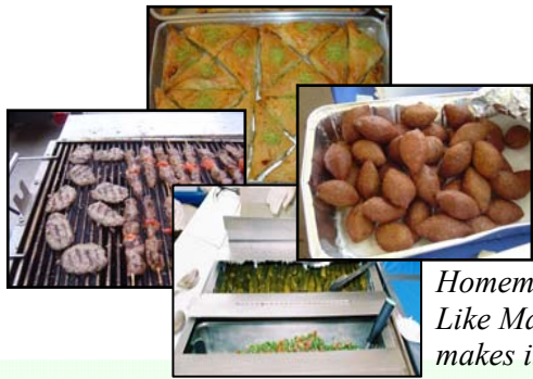
Homemade Like Mama makes it!